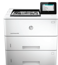
HP LaserJet Enterprise M506x