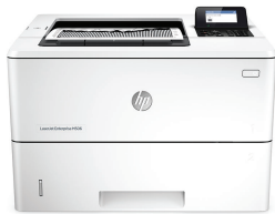
HP LaserJet Enterprise M506n

Finish key tasks faster with a printer that starts right away and helps conserve energy. 1 Multi-level device security helps protect from threats. Original HP Toner cartridges with JetIntelligence and this printer produce more high-quality pages. 2