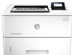
HP LaserJet Enterprise M506dn