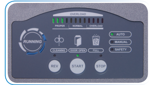
User friendly LED control panel with visual load indicator

* Sheet capacity may vary due to variations in paper and power supply.