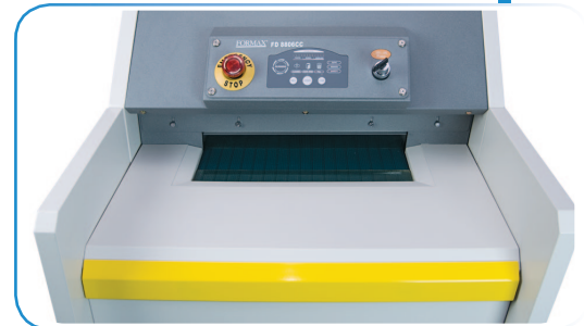
Large infeed table with conveyor belt, and safety bar for immediate shut down