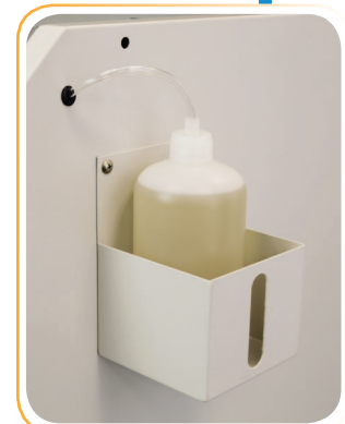
EvenFlow™ Oiling System Reservoir Bottle

Formax - New Hampshire, USA www.formax.com Local Dealer: