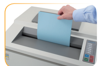
Standard Hopper for hand feeding up to 24 sheets at once